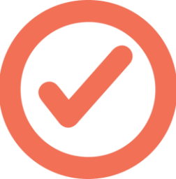
Admin By Request